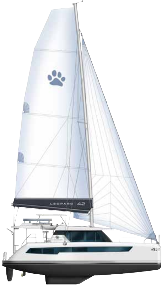
SQUARE TOP MAIN (optional)